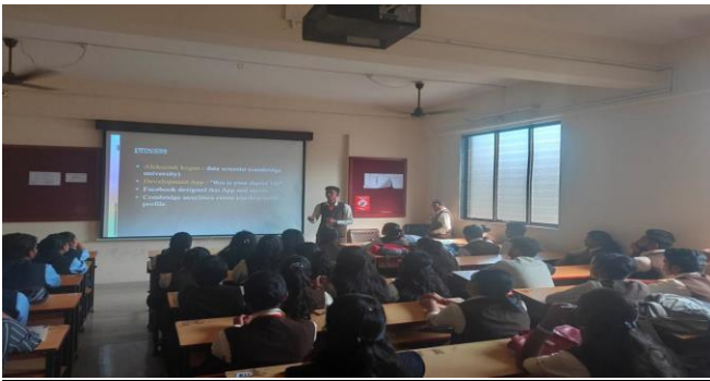
Audience Listen the Speaker Carefully about Scandal of Facebook