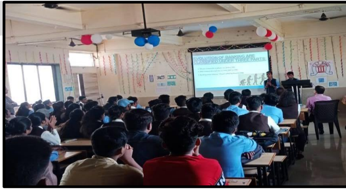
(Students giving presentation of Modernization of Banks)