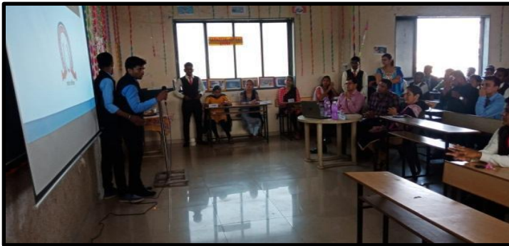
(Students addressing about the Modernization of Banks)