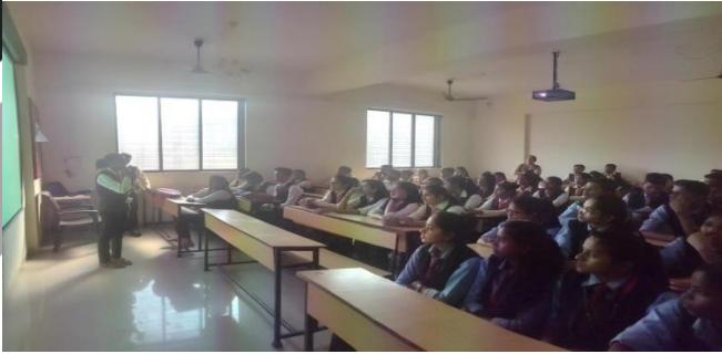
Students explaining about Nirav Modi Scam