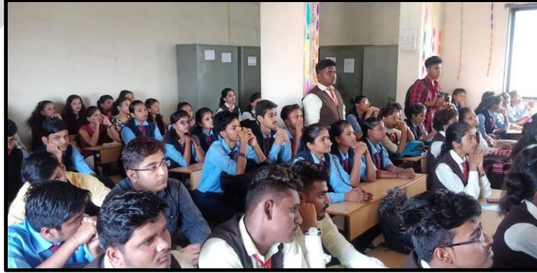
Students Attending Orientation Program