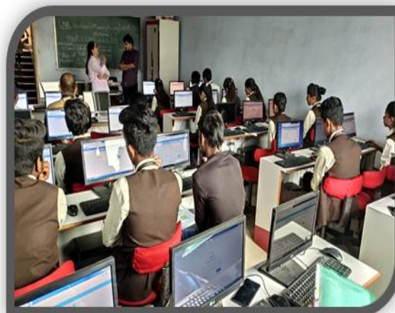
Glimpses of Aptitude Test