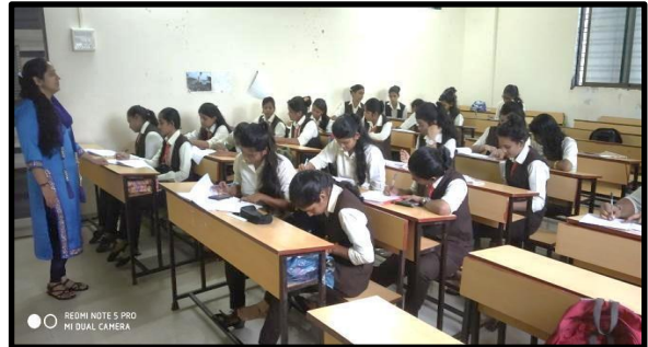
Students While Brain Writing Session