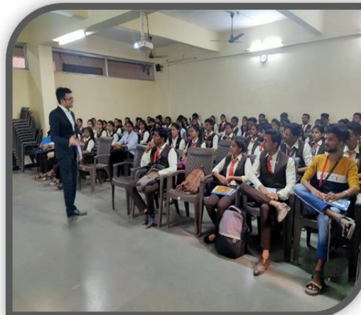
Glimpses of Employability Training