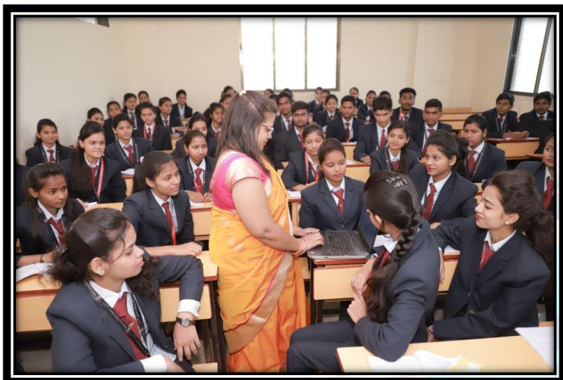
Student Interaction with Faculty Member