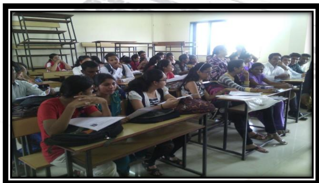
Students interacting with the Subject Expert