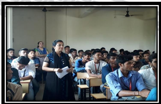
Students attending the Seminar