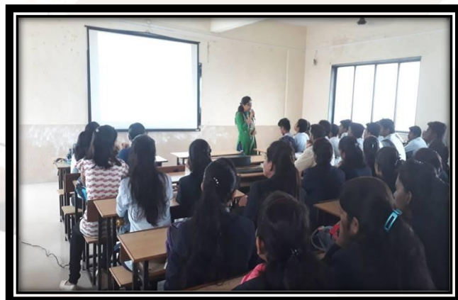
Student's interaction Session