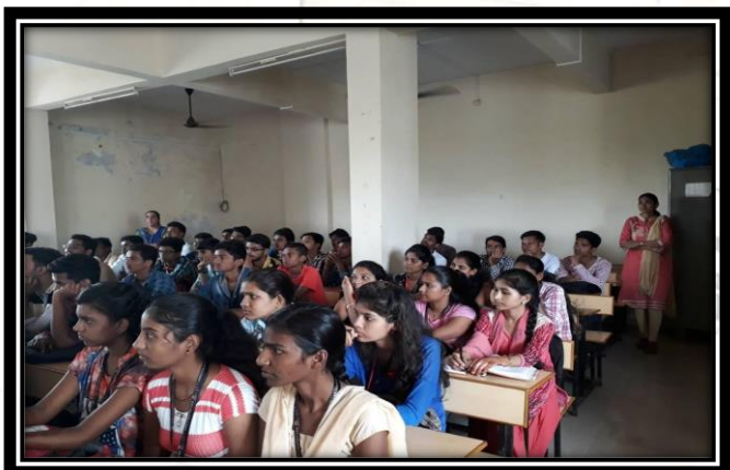
Students observing the session